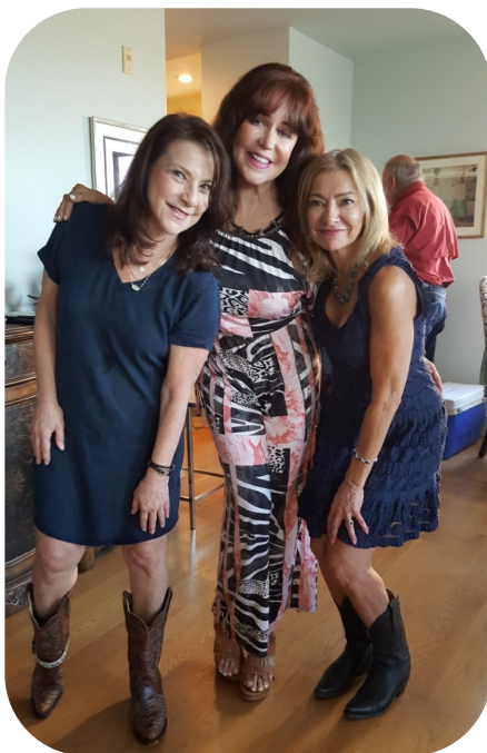
Texas Wine Tasting Social

Summer is winding down – finally. I won't be sad to wave goodbye to the steamy hot weather and all the rain! Even though August was a scorcher, I was thinking about cool weather and cool trips as I counted down the minutes to trip registration on August 9. My ski buds and I have been discussing the trips for several months, and I was ready to jump in and register as soon as the clock struck 7pm. Obviously, same for many of you - response was tremendous and many of the winter trips are full. But always – ALWAYS – get on the wait list if your fav trip is full. Sometimes trips are expanded and sometimes life happens and people drop off for various reasons. So be in line to snatch up any openings.