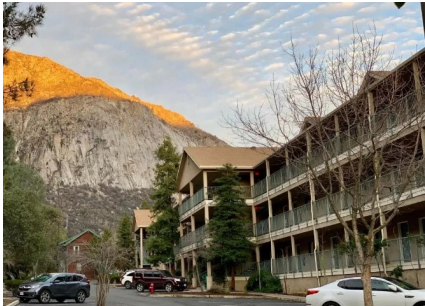
Yosemite View Lodge