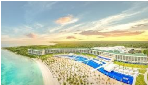
Graphical Depictions of The Maya Riviera Resort

Pricing pp double occupancy. All prices are based on payment by credit card. A 2.99% discount will be deducted for check payments.