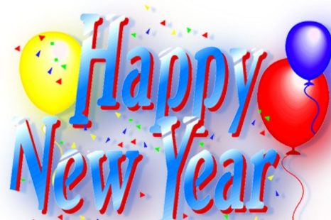
Bing Clip Art