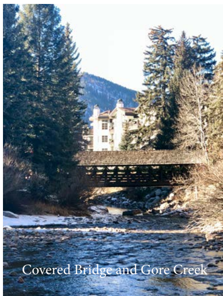
Covered Bridge and Gore Creek

On Saturday morning, it was time to leave Vail. We piled into our two CME vans and headed back to Denver. The United passengers headed to the United Club, and when the Southwest passengers discovered that their plane was delayed they made it to the United Club as well.