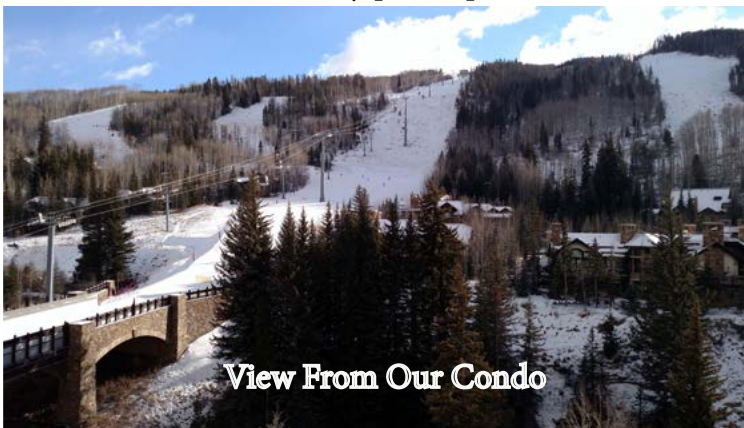
View From Our Condo