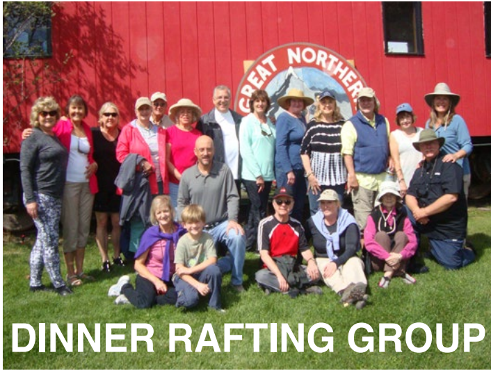
DINNER RAFTING GROUP