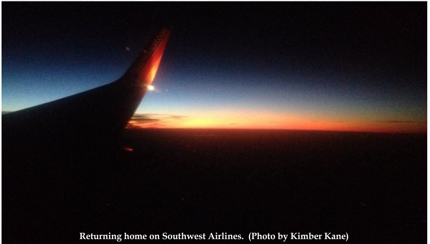
Returning home on Southwest Airlines.