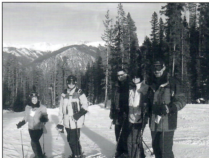
Keystone Thanksgiving Skiing Trip (Above: Sunny day on the Slopes) (Below: SCSC Kids having fun)