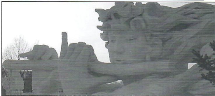
WHISTLER - Art in Ice