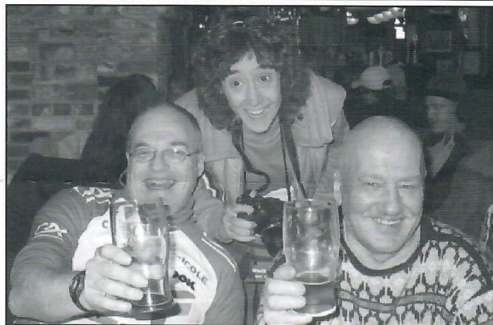
WHISTLER - Toast to the Good Life

It was snowing hard Saturday as our bus departed. Whistler employees said it was the best snow they had experienced all season! I told them SCSC seems to bring snow wherever they go. They should pay US for visiting!