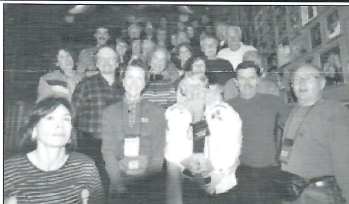
Whistler's Party Animals