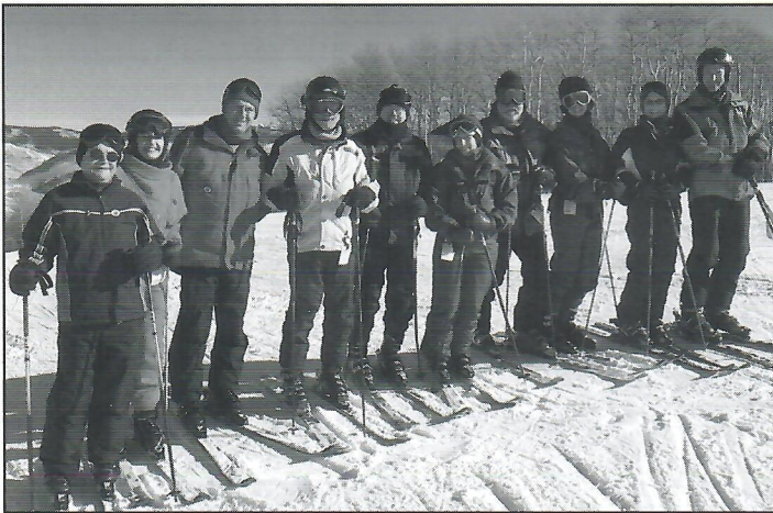
Big Dog Amigos at Beaver Creek