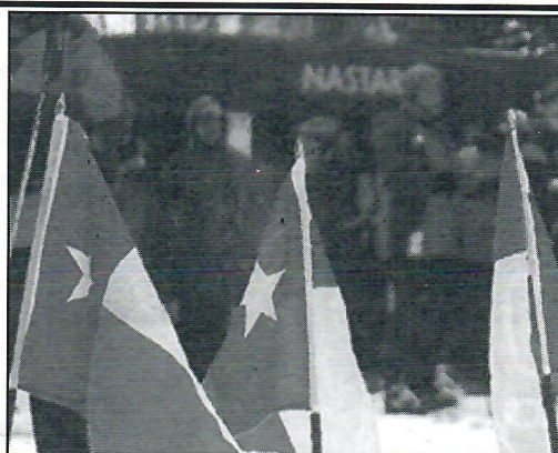
The Lone Star State Flag was everywhere at Beaver Creek, where racers with TSC soundly beat their counterparts from Florida on the NASTAR course