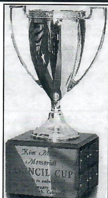
The Kim Miller Memorial Cup: To Ski is to Embrace Life"