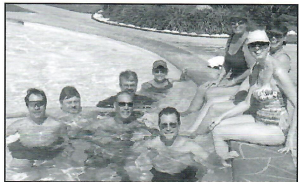
Meltdown group chill at Port Royal's lagoon pool