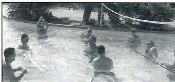
Volleyball game in action