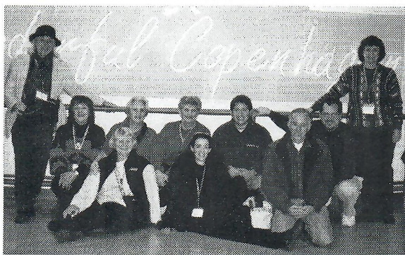
Welcome to Copenhagen, Denmark!