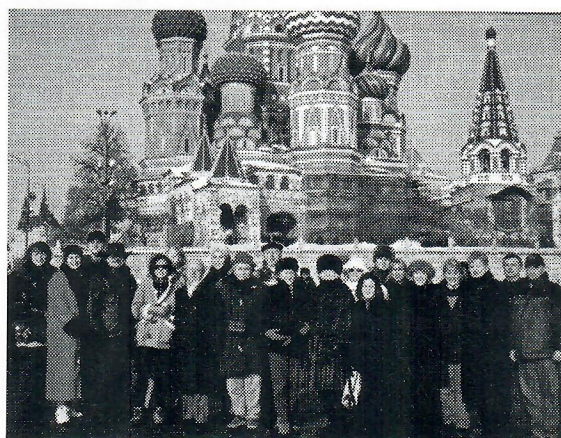
In front of St. Basil's Cathedral – Moscow, Russia