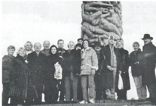
SCSC group at Vigeland Sculpture Park in Oslo, Norway