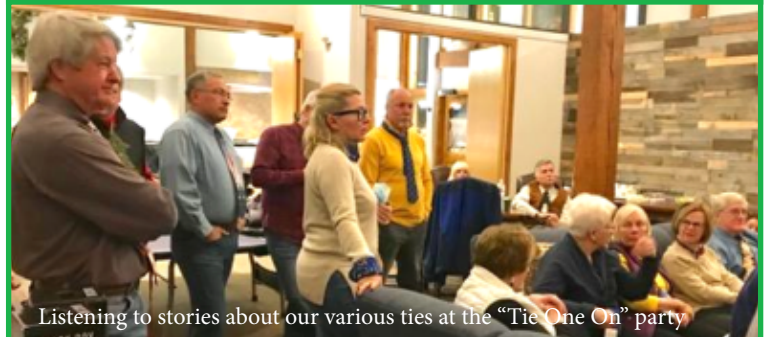
Listening to stories about our various ties at the "Tie One On" party