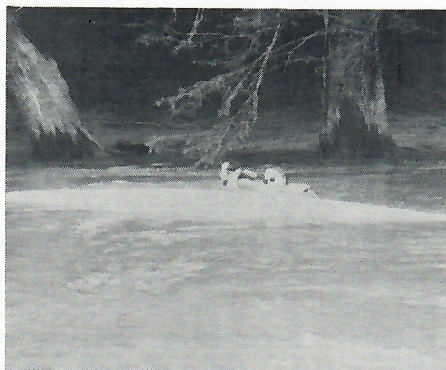
Above: "That was fun...let's do it again!"