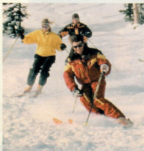
Fun Bunch: The SCSC schedules 11 trips per year to resorts across the country.