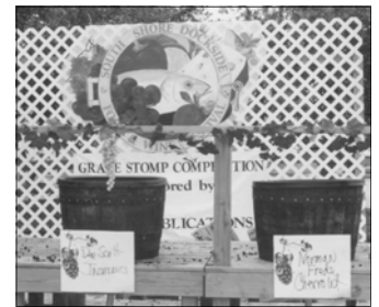
Grape Stomp Competition