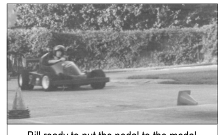
Bill ready to put the pedal to the medal