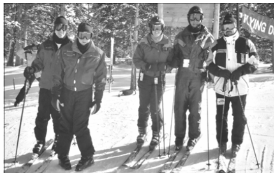
Keystone, Colorado Group