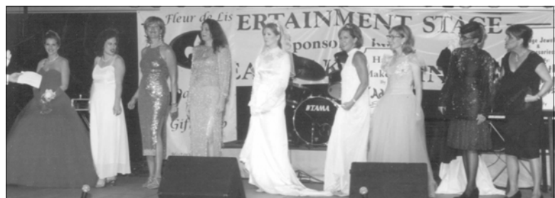
Vintage Fashion Show