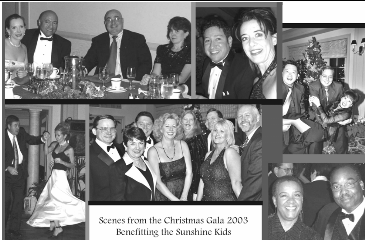
Scenes from the Christmas Gala 2003 Benefitting the Sunshine Kids