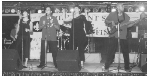
Infinite Groove playing tunes for the crowd