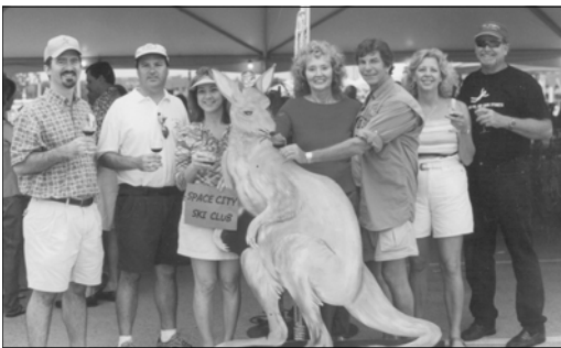
Group enjoys Australian wines with the Kangaroo

For the evening grand finale, a spectacular laser-light show. The light rays floated in the air just above our heads, almost tangible, as they made contact with the buildings showing off their intricate designs. So cool. A nice day was had by all.