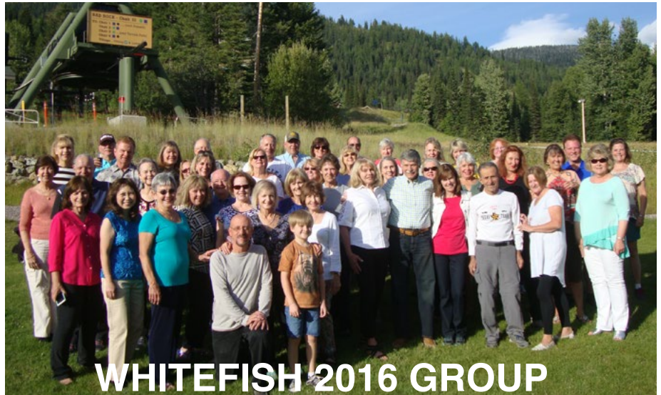
WHITEFISH 2016 GROUP