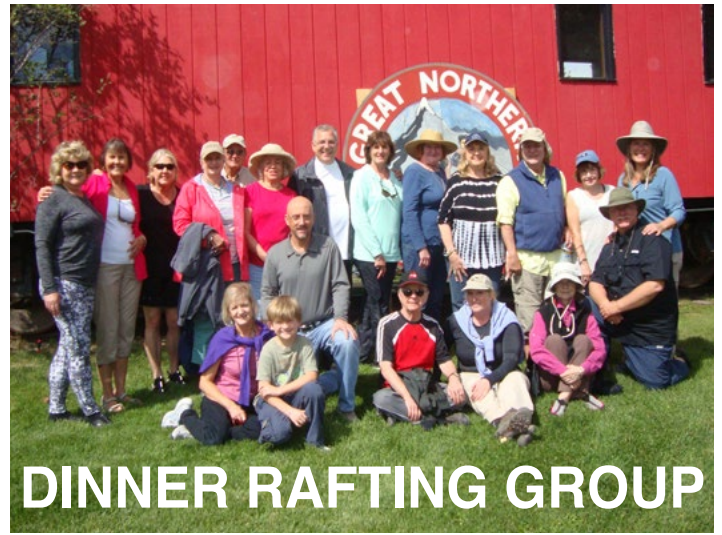
DINNER RAFTING GROUP