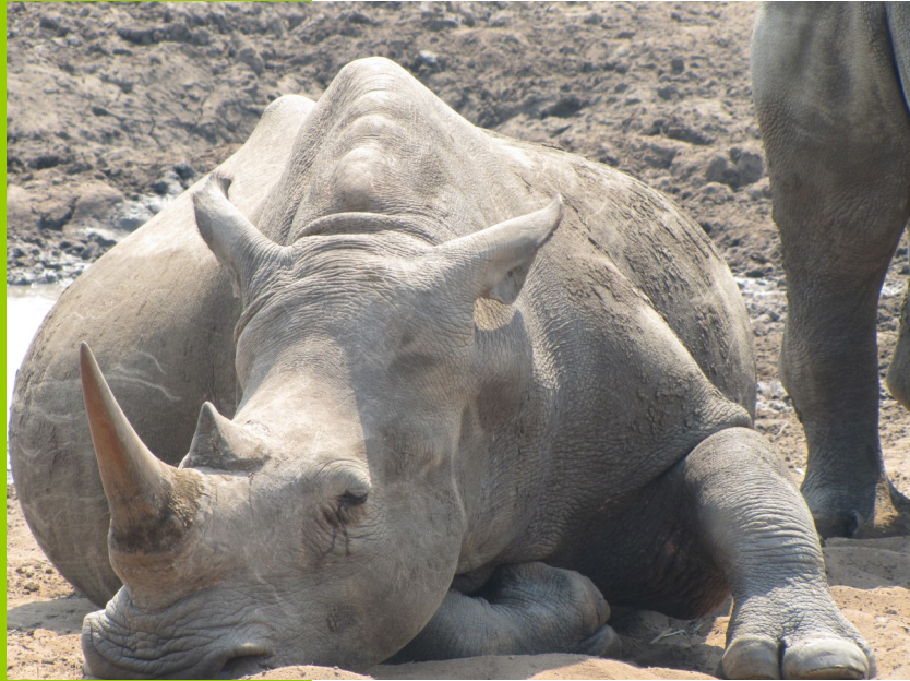
Rhino with horn is an unusual sight. Usually they are removed to prevent poaching.