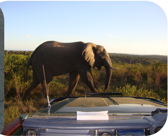
South African elephant. Actual distance!!