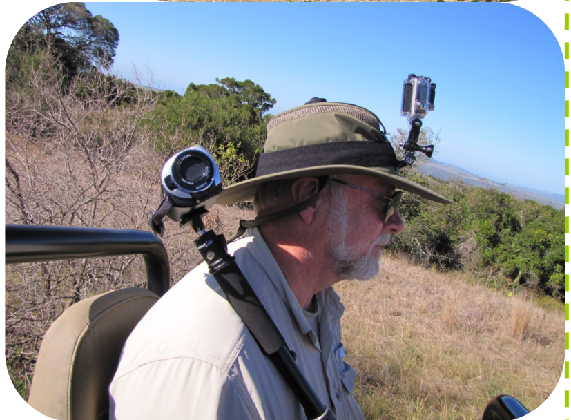
Dennis Hughes capturing the action!